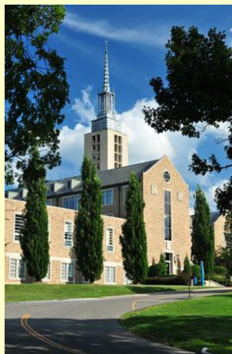
St. John Fisher College Rochester, NY